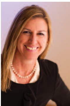
Kent Kallberg Studios

TIME: 17:00 TO 19:00 | LOCATION: VANCOUVER CONVENTION CENTRE | COST: $35