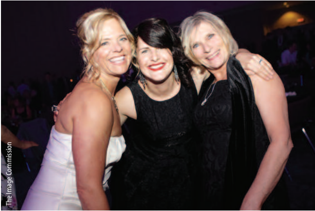
The Image Commission