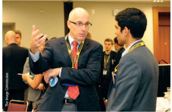
The Image Commission