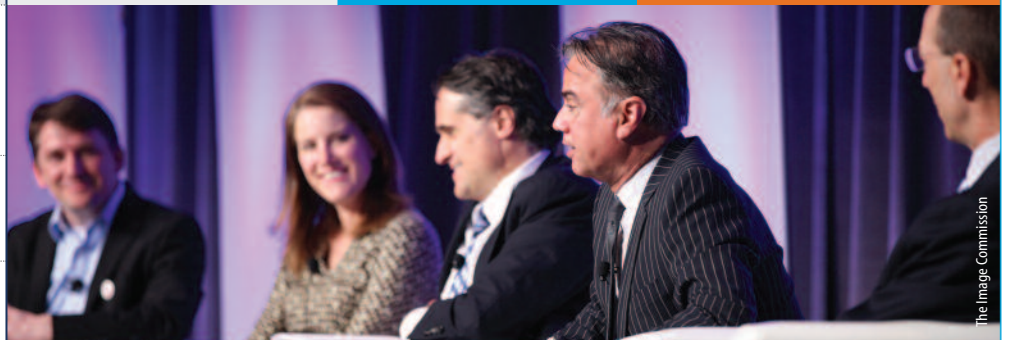
The Image Commission

Reception & Networking Réception et réseautage